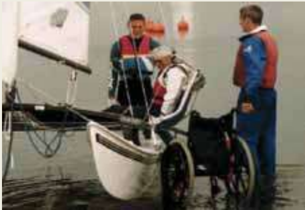
Hobie 16 with a Trapseat