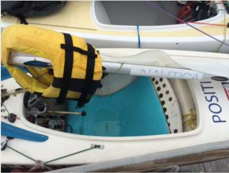
Norlin Mark III 2.4 mR